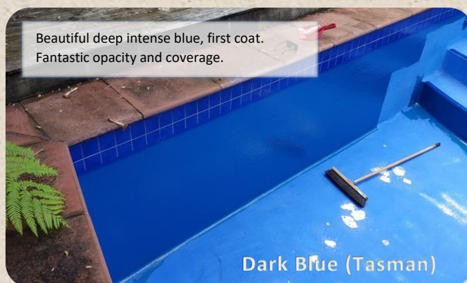
Beautiful deep intense blue, first coat. Fantastic opacity and coverage.