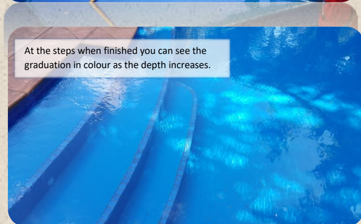
At the steps when finished you can see the graduation in colour as the depth increases.