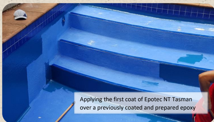
Applying the first coat of Epotec NT Tasman over a previously coated and prepared epoxy

Epotec NT takes advantage of the improved chemistry now available and better satisfies the demands and needs of the pool owner in many ways. This includes more tolerance to weather when curing, improved colour retention, greater film build when needed and easier mixing and application. Epotec NT has been used already in pools and monitored closely. Excellent results from the field, supported all the lab work.