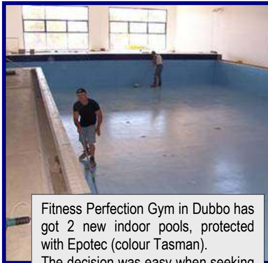
Fitness Perfection Gym in Dubbo has got 2 new indoor pools, protected with Epotec (colour Tasman). The decision was easy when seeking a hard wearing finish. Epotec has proven it self in demanding situations, year in - year out.