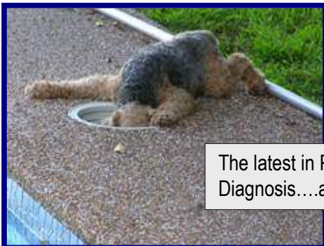
The latest in Pool Problem Diagnosis....a Pool Dogtor!

Recent projects include re surfacing Pebblecrete Pools, a White Epotec Pool, Commercial Pools including a 25 M indoor pool, in a Gym complex. These and others are shown on our web site: www.poolpaint.com.au