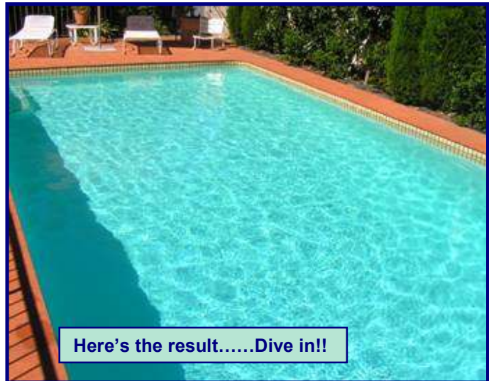
Here's the result.....Dive in!!

Epotec, the proven Hi Build Epoxy Pool (and spa) coating is available for your pool. Be it Fibreglass, Marblesheen or Concrete, Epotec will give it a new lease of life. A life that's long lasting, economic and attractive. We work with you, be it DIY, your painter or Approved Applicator for a great finish, every time. Warranty available. See our web site for helpful information and more images of Epotec in action; www.poolpaint.com.au