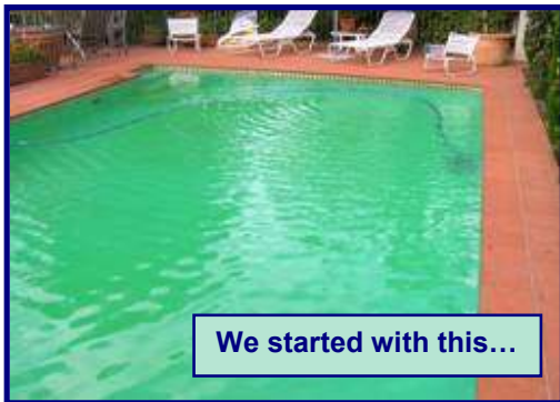
We started with this...

A fine Epotec Mid Blue in Sydney, sets off the dark stained timber surrounds beautifully. A timber decking is a great way to finish your pool surrounds when doing a renovation. It economically creates a new edge and allows for dealing with uneven surfaces, yet looks great. You can use Epotec in Dark Blue as this goes well with any surrounds with a reddish hue to them.